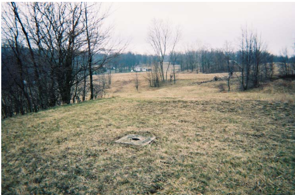
Second view of possible well head, looking east