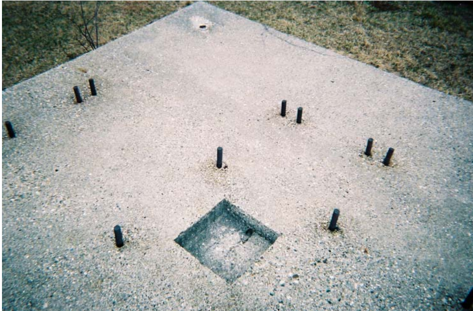
Top of Radar Base with Mounting Bolts