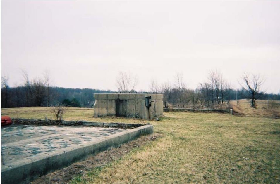
Looking Northeast at old Foundations, From Left to Right is Operations Building, Radar Base and Maintenance/Generator Building