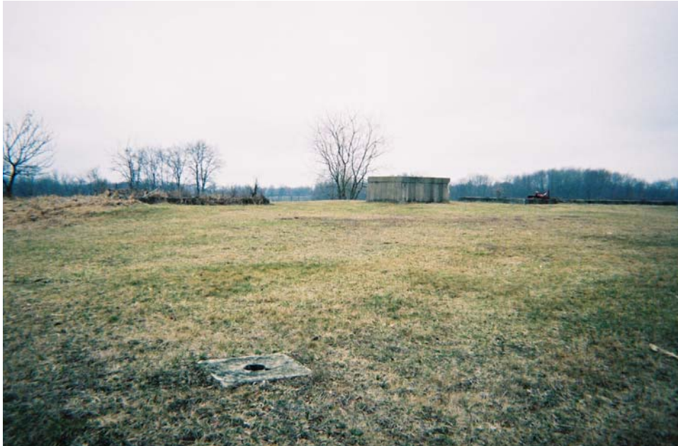
Looking Southwest at Building Foundations Possible water well head in foreground