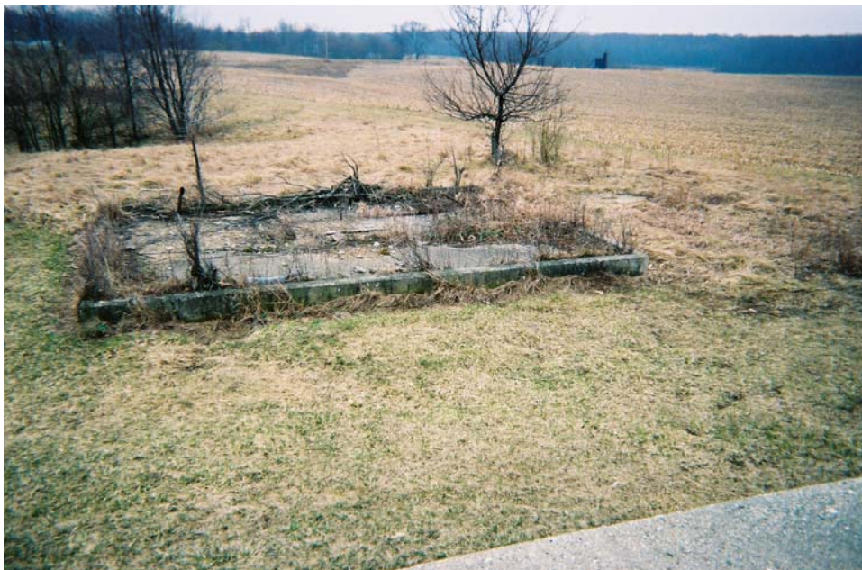
Remains of Maintenance/Generator Building