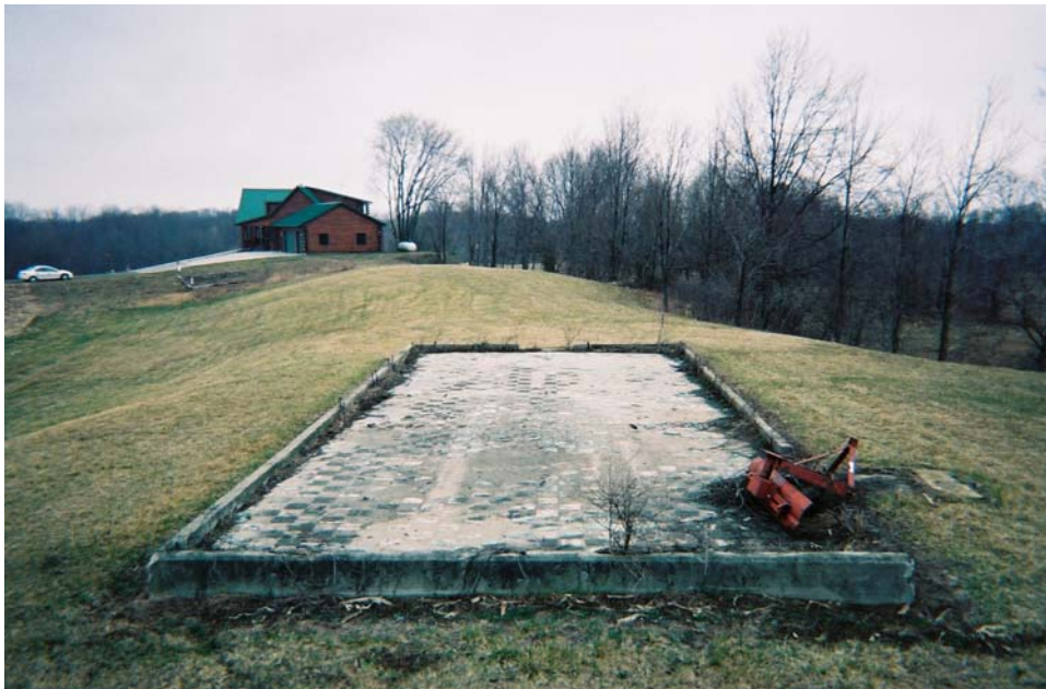
Operations Building Foundation, Looking West Current Property Owner's Home in Background