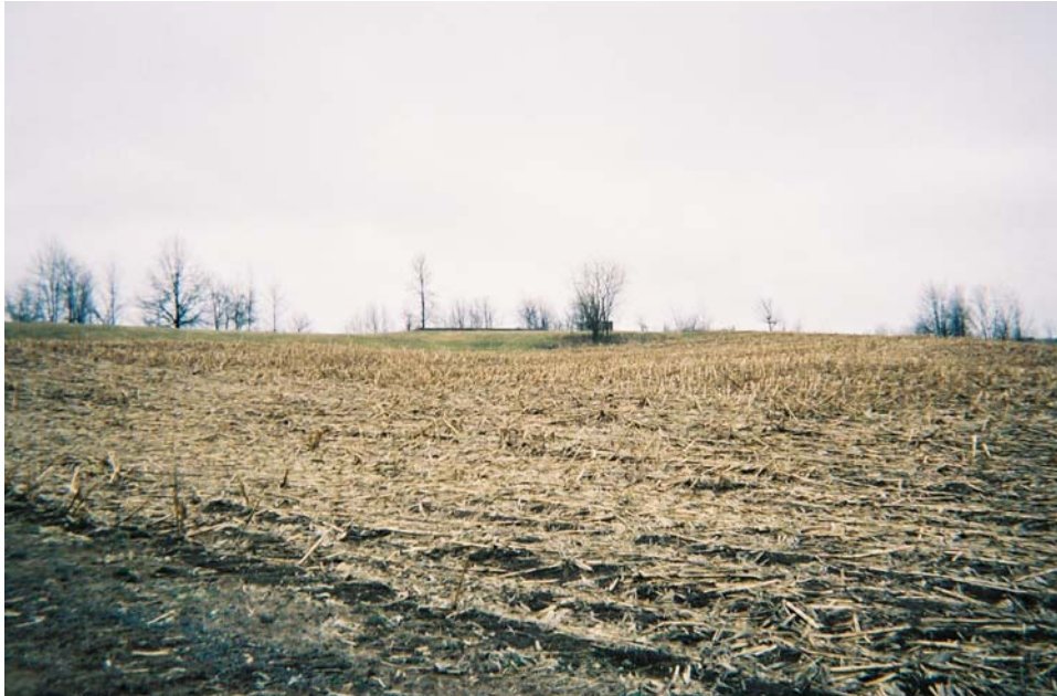
Looking Northwest at Radar Site Base for the Radar is behind tree