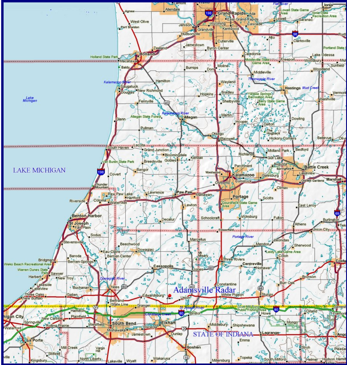
Vicinity Map Adamsville Radar DERP-FUDS Property No. E05MI1241 Cass County, MI N 41° 50' 09.5" W 85° 56' 19.4"