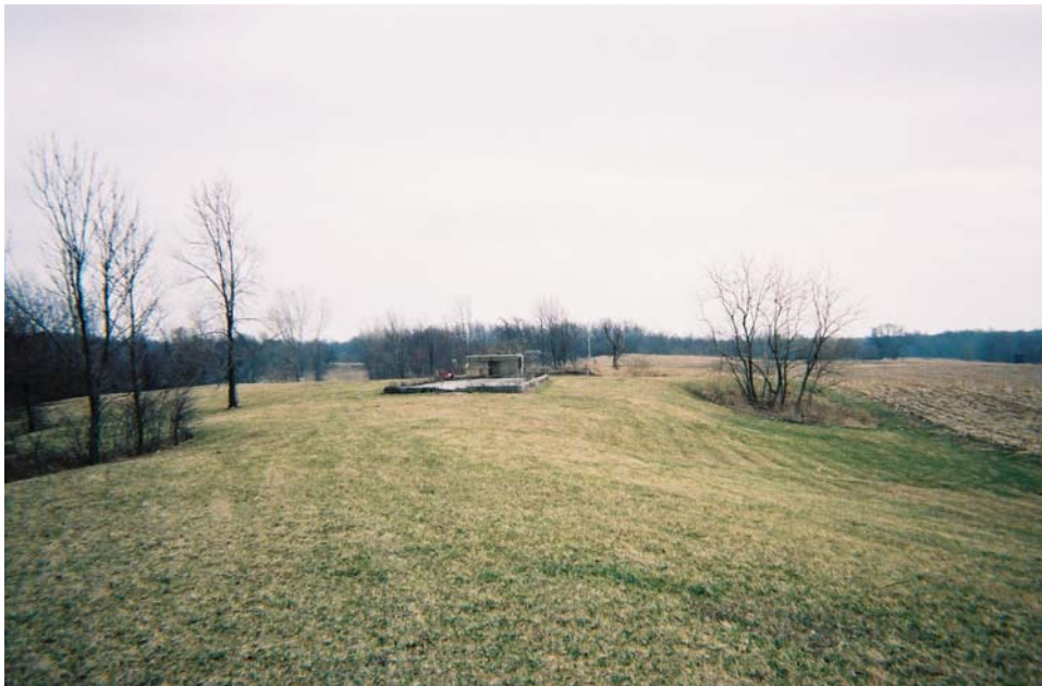
Looking at Remaining Foundations to East