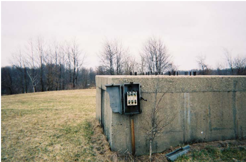
Close up of Radar Base with Abandoned Electrical Box