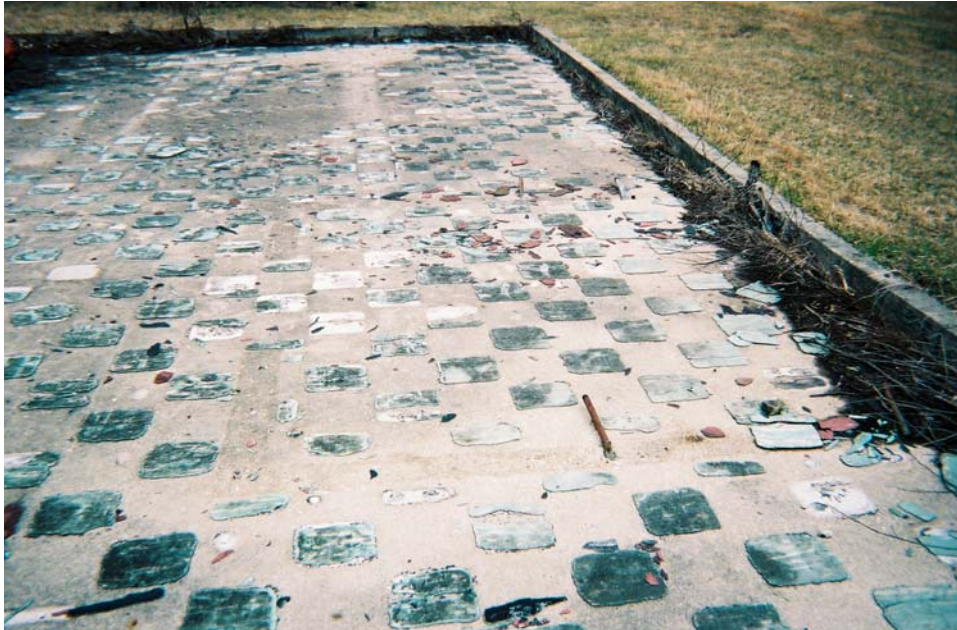
Close Up of Remains of Operations Building